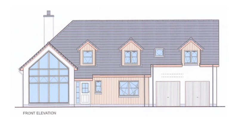
Figs 8, 9 & 10 selection of house types for private phases 2 and 3