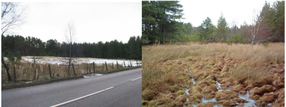
Fig 2 site entrance from B9153

1. The site for this application is generally to the south west of Carrbridge and essentially fills land between Carr Road and the B9153 where it enters the village (see fig 1).