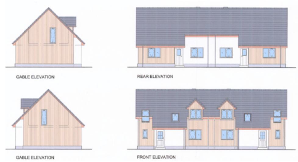
Fig 7 Semi-detached affordable housing (phase 1)

11. The application itself is for 117 houses on an estate layout (see fig 6); all but 5 of the houses would be accessed from the B9153 at the southern entrance to Carrbridge. There would then be a 40 metre depth landscape belt as required by the outline approval. An estate road leads to the 24 houses with two private houses (Phase1) and a small play area. Most of this development would be on land that is currently used for grazing. However, because of the required landscaping belt, this pushes the development back into an area of hummocky terrain where a small number of trees, including Scots pine would have to be removed.