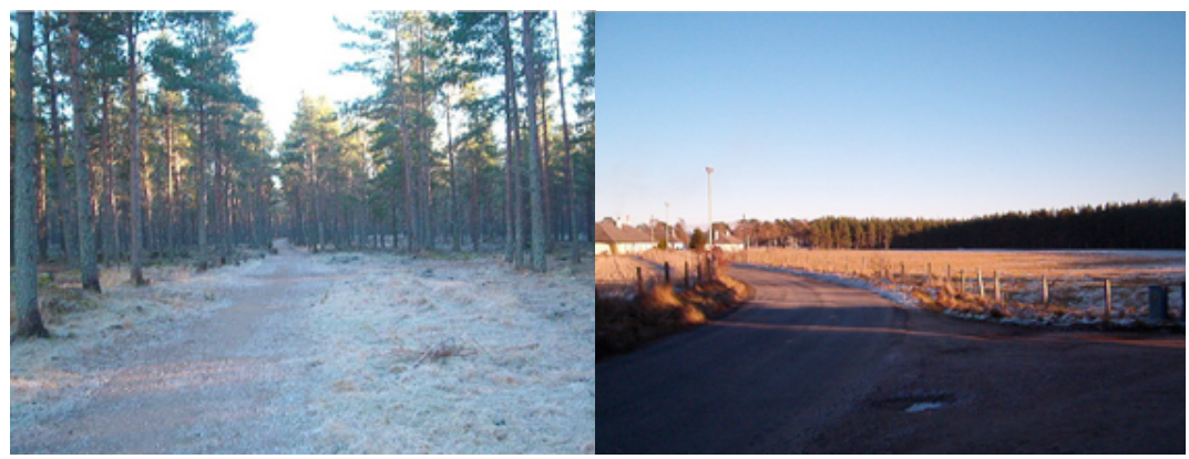
Fig 4 Sustrans Cycle Route