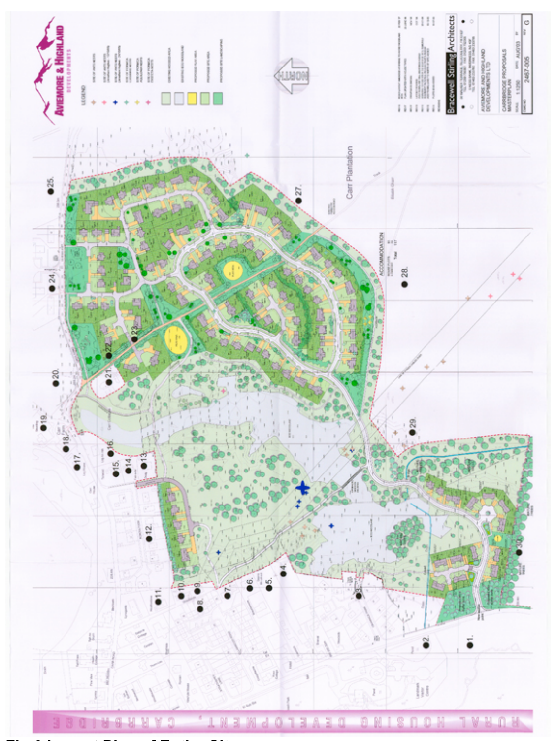
Fig 6 Layout Plan of Entire Site